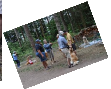
Bobbing For Hot Dogs

Overall, the most popular and participated in event was relaxing and chatting with fellow Golden people.