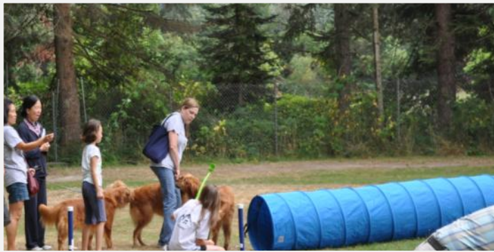
Agility Tunnel—in one end and out the other!